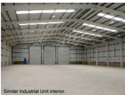
Similar Industrial Unit interior.

WITCHCRAFT WAY, RACKHEATH INDUSTRIAL ESTATE